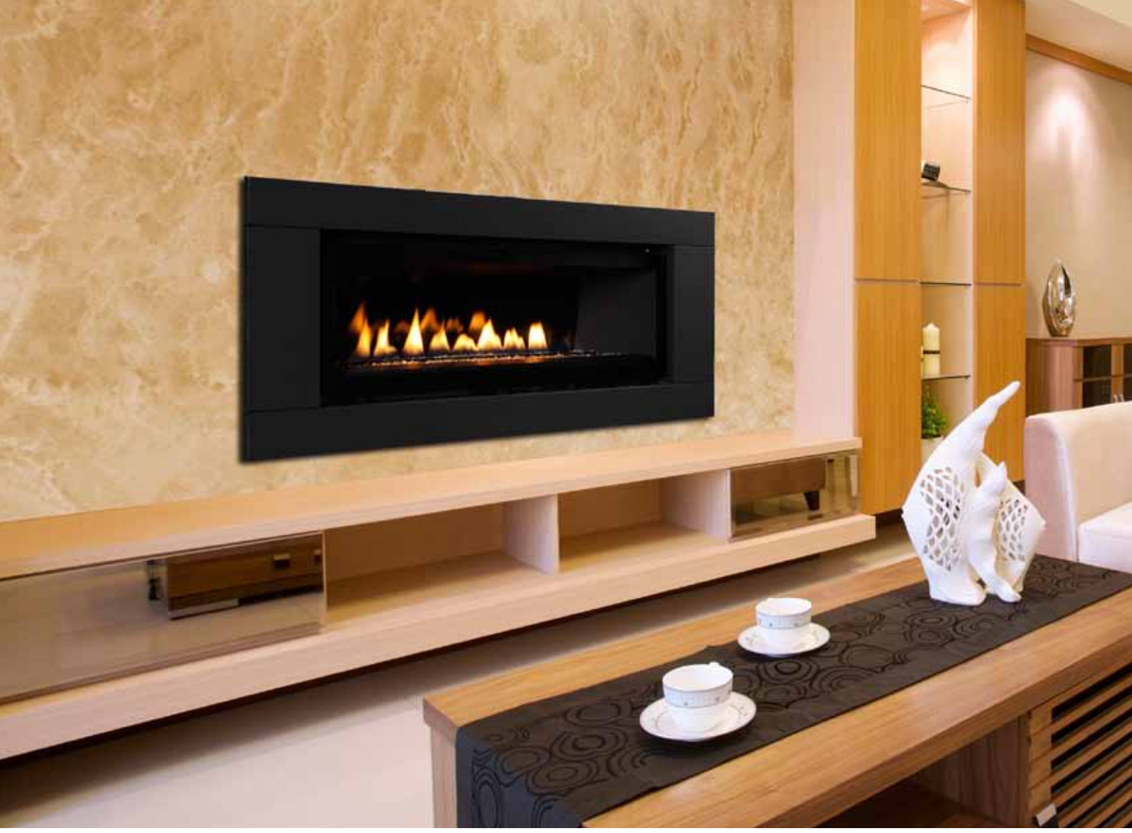
Elite LV™ 54"shown

■ The Elite™ LV fireplace represents the latest in technology and design resulting in the ultimate combination of style and performance. The focal point of the LV is it's mesmerizing flame. Showcased by a glassy smooth porcelain interior and framed by your choice of optional surrounds, the flame is not only stunning, but, thanks to cutting edge Infini-Flame technology, it is also the heart of a highly efficient heater; the end result being a fireplace that uses less fuel to heat your home while making it more beautiful. ■