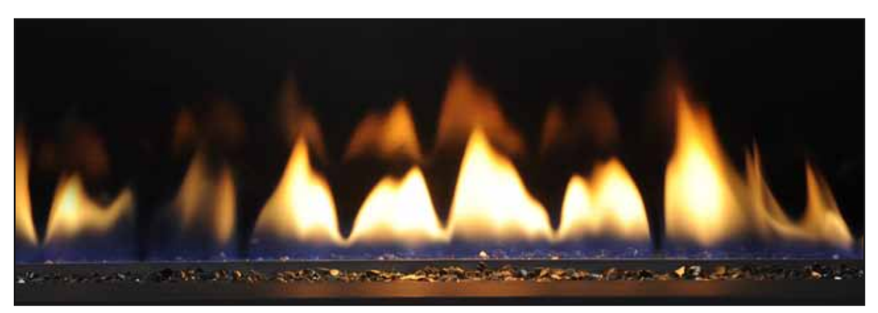
Elite™LV shown with Reflective Black media and Porcelain interior.

■ The Elite™ LV fireplace represents the latest in technology and design resulting in the ultimate combination of style and performance. The focal point of the LV is it's mesmerizing flame. Showcased by a glassy smooth porcelain interior and framed by your choice of optional surrounds, the flame is not only stunning, but, thanks to cutting edge Infini-Flame technology, it is also the heart of a highly efficient heater; the end result being a fireplace that uses less fuel to heat your home while making it more beautiful. ■